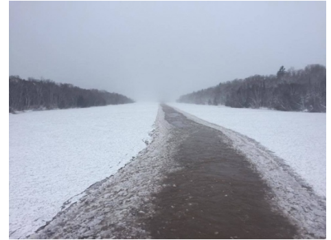
Photo 3: The Coast Guard Cutter Alder breaks a path through the ice in the Keweenaw Waterway near Houghton, Mich., Dec. 16, 2016. The Alder and other Great Lakes Coast Guard cutters commenced Operation Taconite, the Coast Guard's largest domestic ice-breaking operation, encompassing Lake Superior, the St. Mary's River, the Straits of Mackinac and Lake Michigan, Dec. 19, 2016.

in Houghton, Mich., Dec. 16, 2016. The Alder and other Great Lakes Coast Guard cutters commenced Operation Taconite, the Coast Guard's largest domestic ice-breaking operation, encompassing Lake Superior, the St. Mary's River, the Straits of Mackinac and Lake Michigan, Dec. 19, 2016.