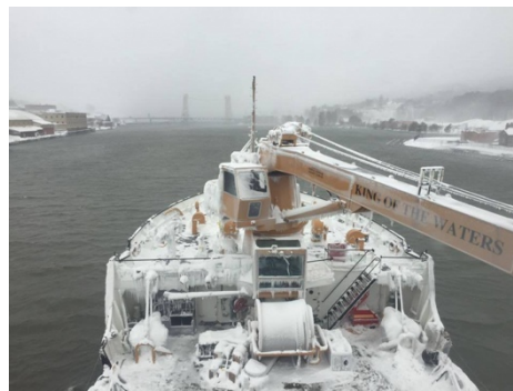
Photo 2: The Coast Guard Cutter Alder approaches the Portage Lake Lift Bridge

in Houghton, Mich., Dec. 16, 2016. The Alder and other Great Lakes Coast Guard cutters commenced Operation Taconite, the Coast Guard's largest domestic ice-breaking operation, encompassing Lake Superior, the St. Mary's River, the Straits of Mackinac and Lake Michigan, Dec. 19, 2016.