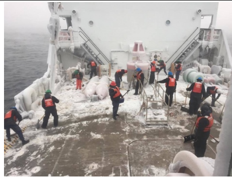
Photo 1: The crew of the Coast Guard Cutter Alder clears ice from the deck of the cutter as the ship transits through Lake Superior Dec. 14, 2016. The Alder and other Great Lakes Coast Guard cutters commenced Operation Taconite, the Coast Guard's largest domestic ice-breaking operation, encompassing Lake Superior, the St. Mary's River, the Straits of Mackinac and Lake Michigan, Dec. 19, 2016.